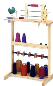
Warping Mill with electric winder

Tools for: Needle Felting, Rug Punch, Locker Hooking, Spinning, Weaving and other fiber arts Wool Roving & Exotic Fibers: Alpaca, Bamboo, Camel, Cashmere, Cotton, Merino, Mohair, Romney, Sea Cell, Soy, Silk, Tencel, Yak!