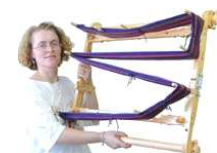
$55 Warping Board