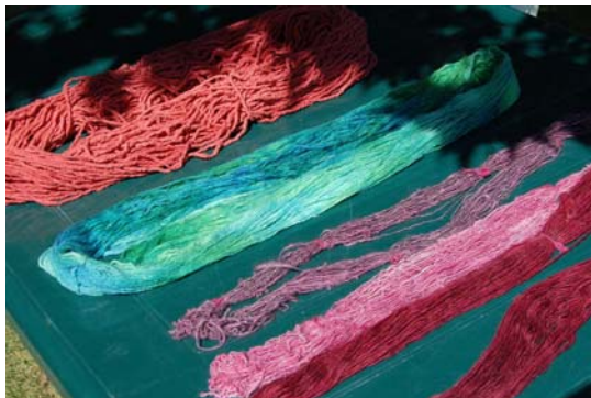
A Yarn Flower Garden with an array of beautiful color.

A lovely Autumn day picnic with yummy food and good company too.