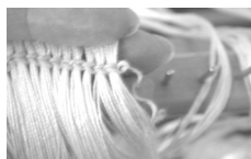
Warping A Loom