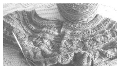
Knitting Socks, Summer Bags & More